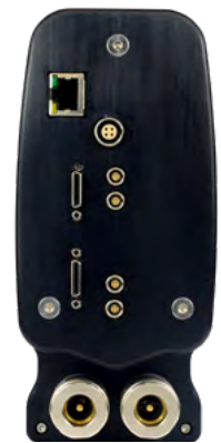
SWaP : H175 x W76 x L242.4 mm, 4.2 kg, up to 90 W typical with cooling